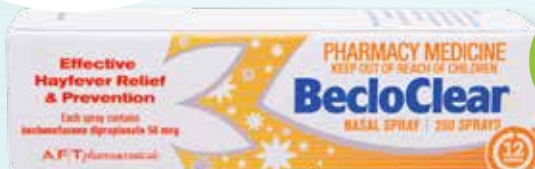
BecloClear 200 Sprays

BecloClear Nasal Spray provides 12 hours of effective hayfever relief and prevention in a 200 spray bottle.