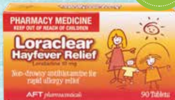
Loraclear 90 Tablets