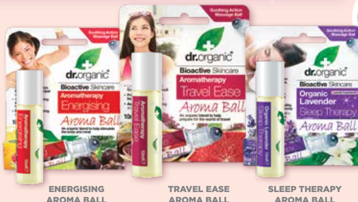
ENERGISING AROMA BALL

These natural remedies use the finest organic therapeutic fragrances such as lavender, patchouli and cedarwood to inspire your senses, clear your mind and encourage natural healing.