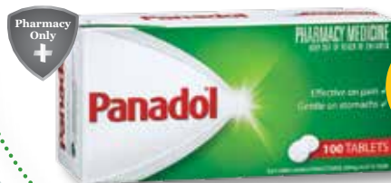
PANADOL 100 Tablets

Panadol tablets are gentle on the stomach and provide fast, effective temporary relief of aches and pains.