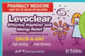
Levoclear 10 Tablets

Levoclear provides 24 hours of effective, fast acting, non-drowsy relief from the symptoms of hayfever and allergic rhinitis including runny nose, nasal congestion, itchy nose and eyes and sneezing.