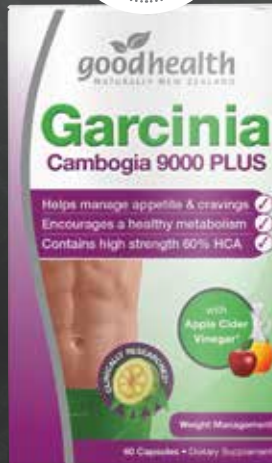
Garcinia Cambogia 9000 with Apple Cider Vinegar 60 Capsules