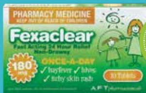
Fexaclear 10 Tablets

Fexaclear 180mg, provides 24 hours of effective, fast acting relief from the symptoms of hayfever and allergic rhinitis including runny nose, nasal congestion, itchy nose and eyes and sneezing.