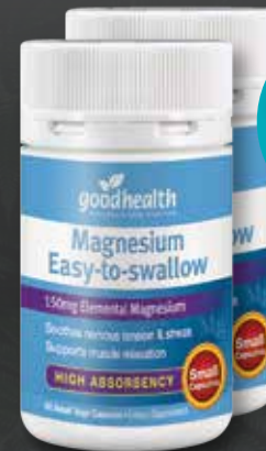
Magnesium Easy-to-swallow 2 x 90 Small Vege Capsules