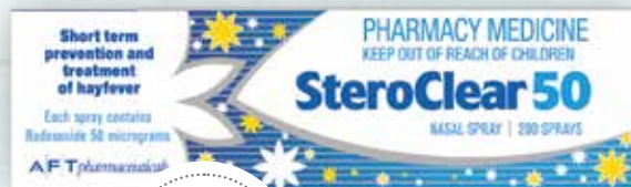
SteroClear 50 200 Sprays

SteroClear Nasal Spray provides short term prevention and long lasting relief of hayfever in a handy 200 spray bottle.