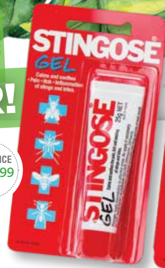
STINGOSE GEL 25ml