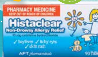
Histaclear 90 Tablets