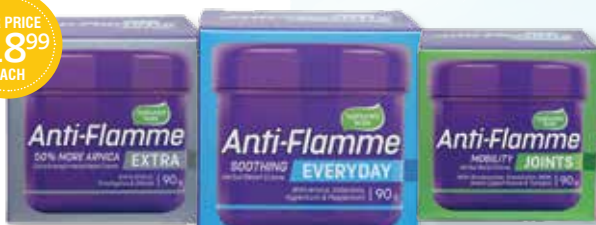
ANTI-FLAMME EXTRA 90g