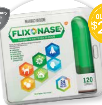
FLIXONASE NASAL SPRAY 120 Sprays