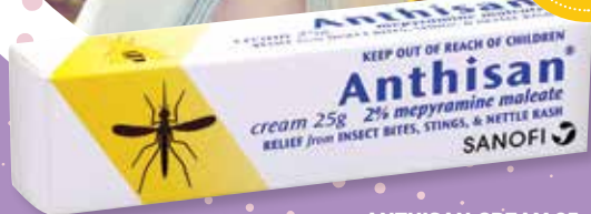
ANTHISAN CREAM 25g