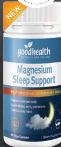
Magnesium Sleep Support 60 Vege Capsules