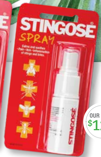
STINGOSE SPRAY 25ml